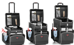
Available Quick Cart Sizes